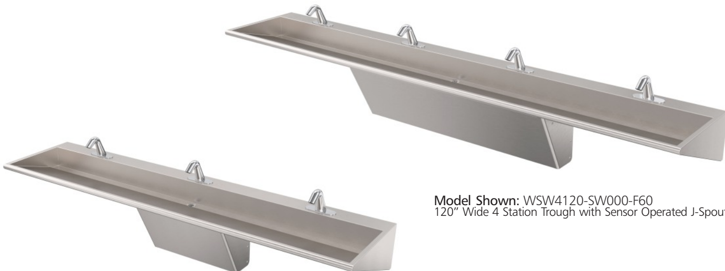
Model Shown: WSW4120-SW000-F60 120" Wide 4 Station Trough with Sensor Operated J-Spout

Additional Accessories include a Daisy (Drain) Strainer with Tailpiece and a P-Trap Assembly made of Plastic or Chrome Plated Brass.