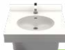
Model No. 9221