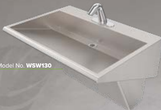
Model No. WSW130