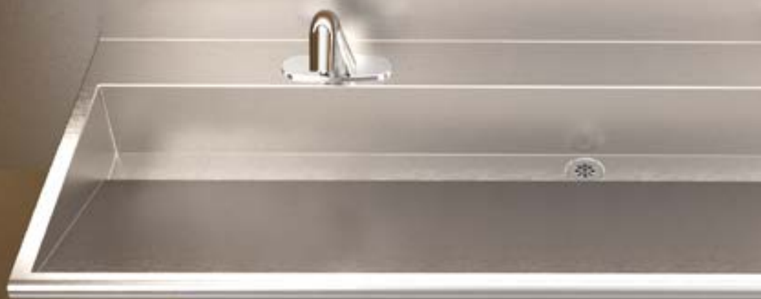
Stainless Steel Wedge WSW260