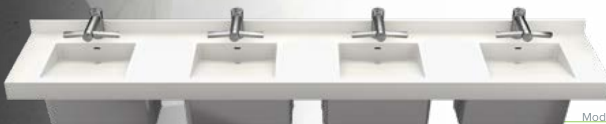
Model No. 9224