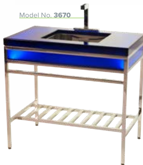
Model No. 3670