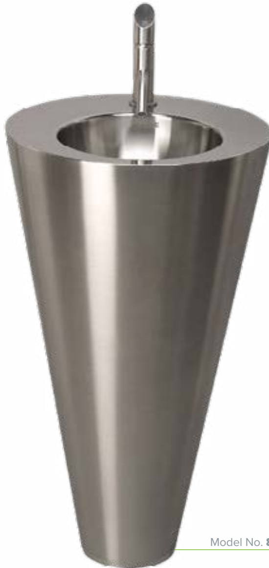
Model No. 8931-RLS