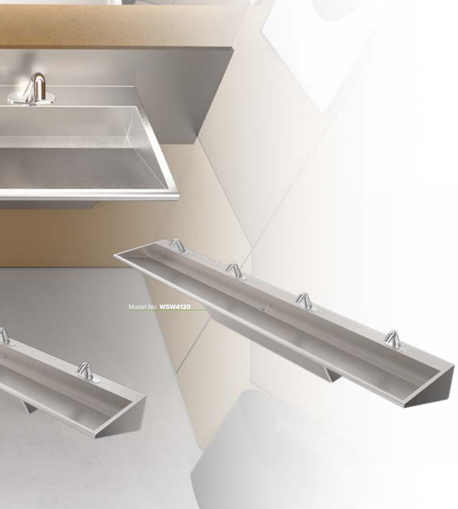
Model No. WSW4120

Technical Certifications/Compliances: U.S. Patent No. D841,785; ADA; CSA; CBC; cUPC