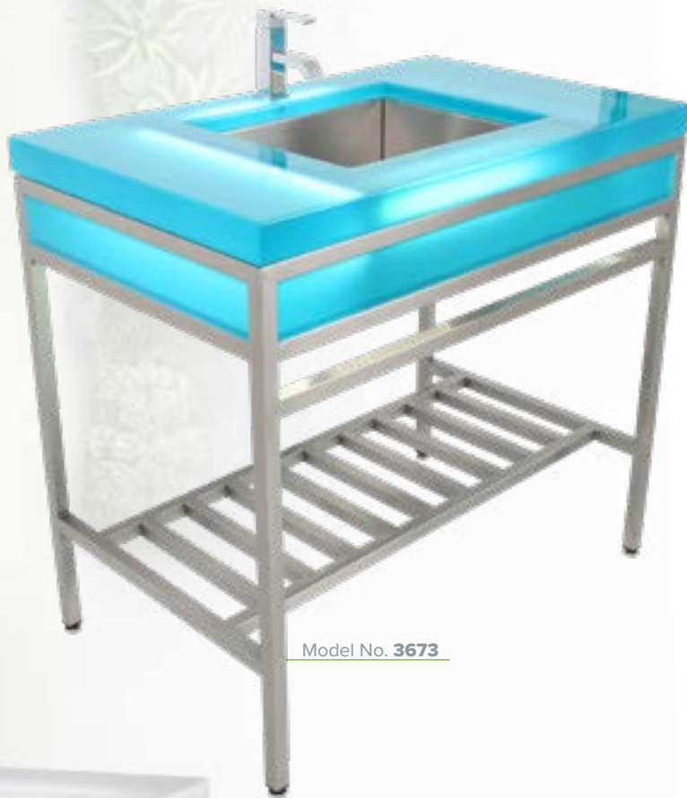
Model No. 3673