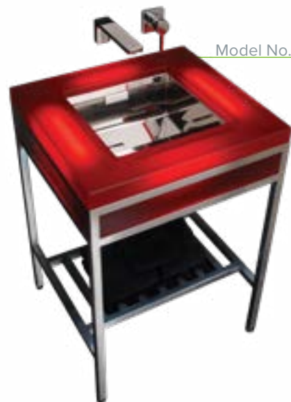
Model No. 3668