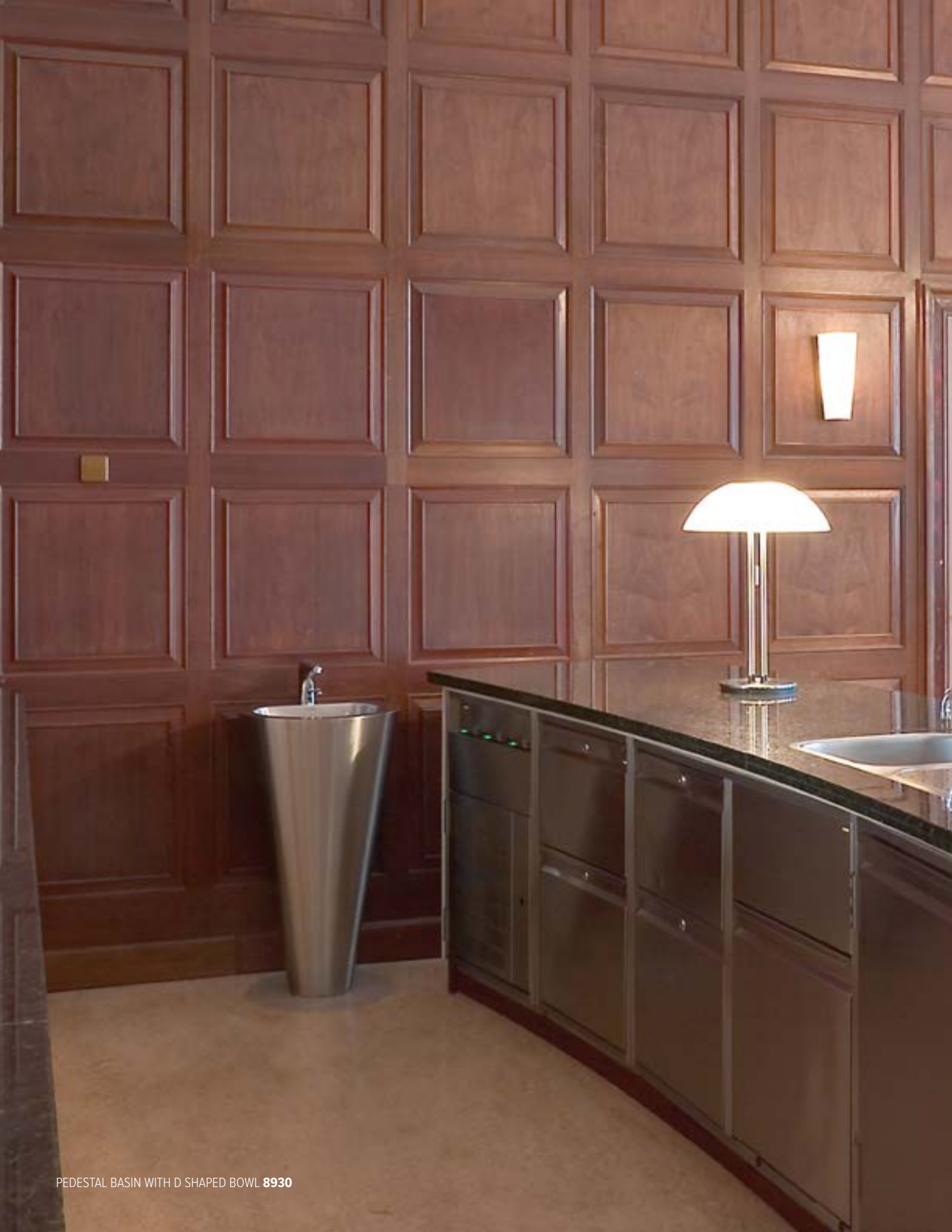
PEDESTAL BASIN WITH D SHAPED BOWL 8930