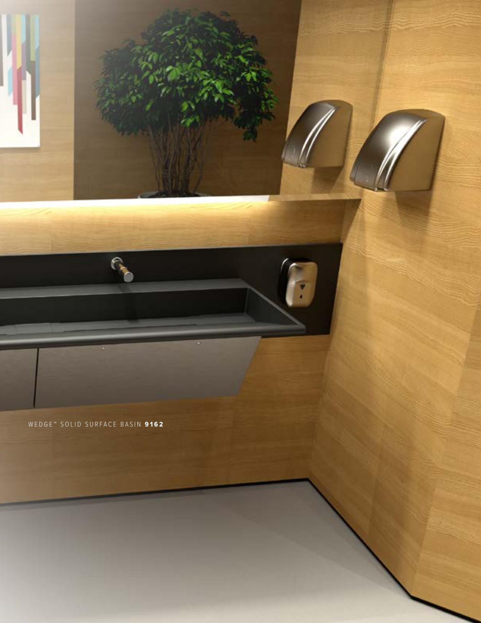
WEDGE™ SOLID SURFACE BASIN 9162