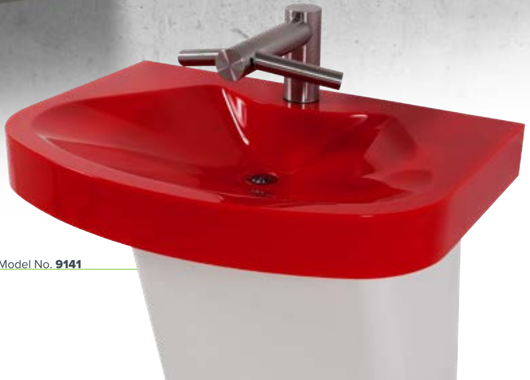
Model No. 9141