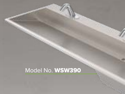
Model No. WSW390