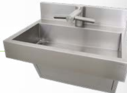
Model No. HWS9171