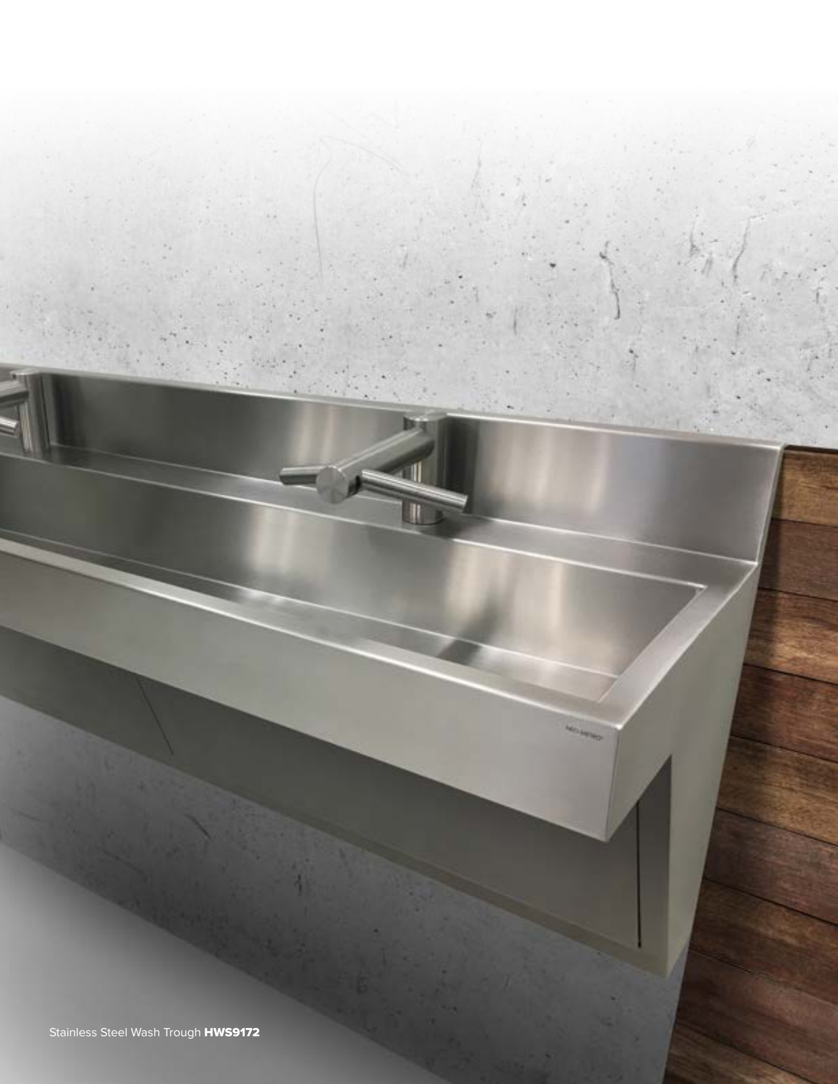
Stainless Steel Wash Trough HWS9172