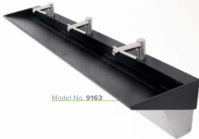
Model No. 9163