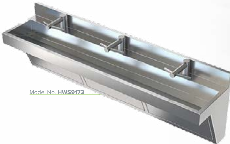
Model No. HWS9173

Technical Certifications/Compliances: US Design Patent D433, 743; ADA; cUPC; lead-free