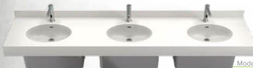
Model No. 9223