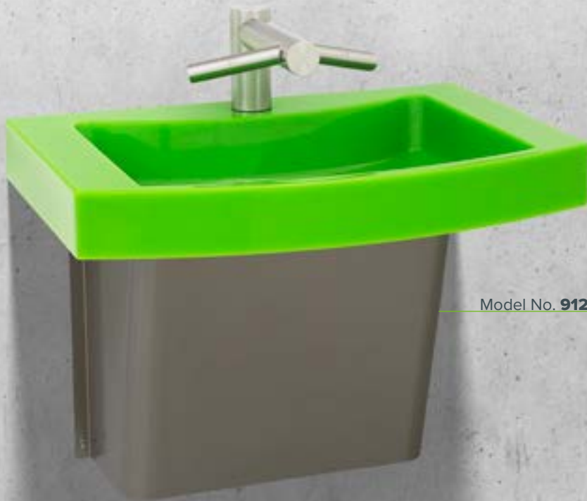
Model No. 9121

Technical Certifications/Compliances: U.S. Design Patents D727,475 and D744,074, ICPA SS-1, OBC, UFAS, ADA, Lead-Free