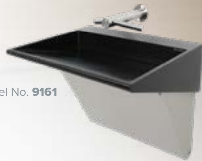
Model No. 9161