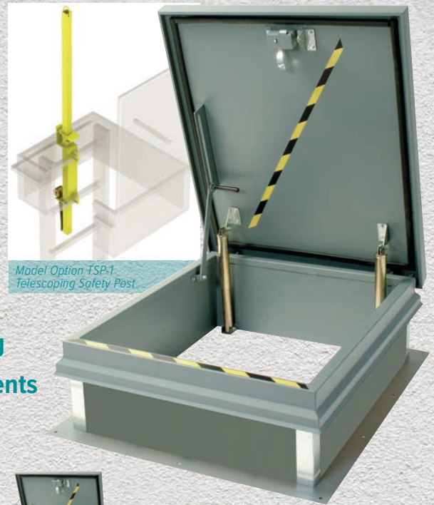
Model Option TSP-1 Telescoping Safety Post